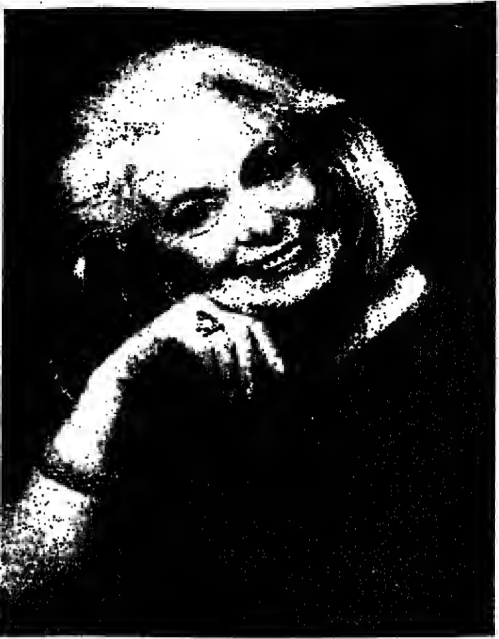
Dame Gwyneth Jones: 'Ever since I was a child I always wanted to visit the Holy Land.'

"I love them, they are very beautiful. People think that Berg is very modern, but these songs are so romantic, so beautiful and so lush. It's not 12-tone music." A few years ago, Jones received the title dame from Queen Elizabeth II. "It's a wonderful honor and very special. It's the highest honor you can have. I have received high honors from the governments of Austria, Germany and France, but this is very special because you are recognized in your own land. And because there are fewer women than men who receive this honor, I was and still am extremely proud of it." When she leaves Israel, Jones will travel directly to her homeland of Wales for a special project she is organizing. "There is this beautiful castle in Craig-y-nos, which has a small opera house in it, and we are renovating it. I want to form an opera studio there, and if all the plans go in the right way we will open it in 1999. I will give a few masterclasses there every year whenever I will have time and we will also concentrate on performances for